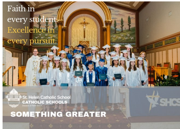
Exhibit integrity, honesty, and confidence Lead by doing

The work of St. Helen Catholic School is the work of our entire community. All successes have been and will continue to be the result of school families, parishioners, and the greater community working together to ensure that our school continues to offer a highly effective and rigorous academic program that is mission-driven and well managed. We invite all parishioners to join us in this faith-centered academic endeavor. We thank you for your time, talent and treasure. Every prayer, every minute, every dollar makes a difference and we are grateful for your support.